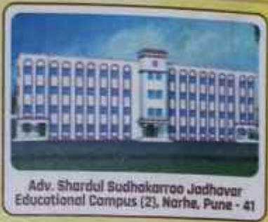
Adv. Shardul Sudhakar Rao Jadhavar Educational Campus (2), Narhe, Pune - 41

Surekha Bai Sudhakar Rao Jadhavar Educational Campus (3), Vadgaon Bk., Pune-41.