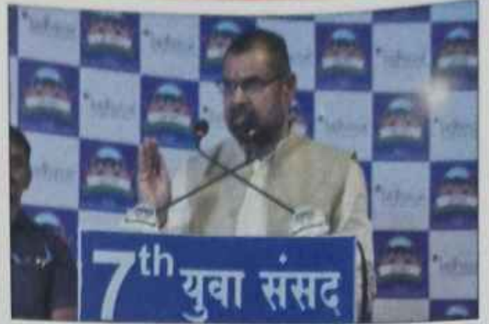
Shri. Sadabhau Khot