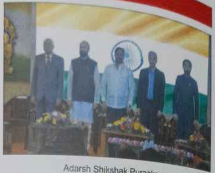
Adarsh Shikshak Puraskar