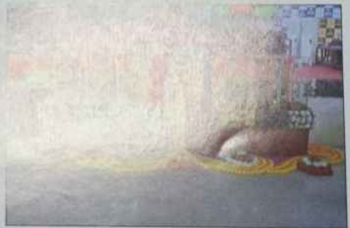
7 th Yuva Sansad - Dais