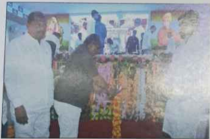
Lightening the Lamp