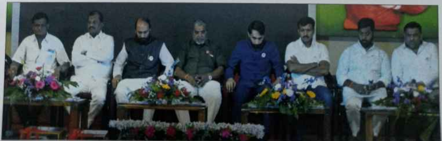
7 th Yuva Sansad - Dignitaries on the Dais