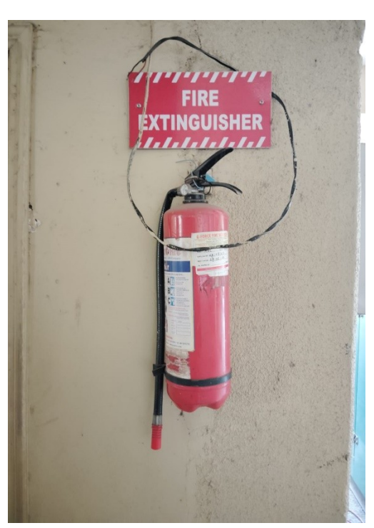
Auditorium ICT Abled