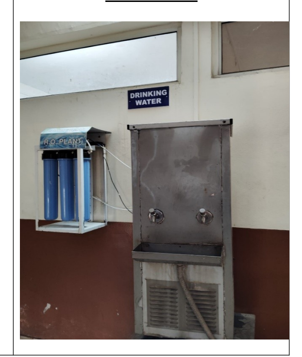
Water - Filter